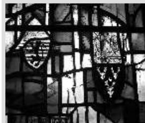
Modern Glass @ Rotherham Bridge Chapel

HERITAGE INSPIRED is supported by the Heritage Lottery Fund. We work with partner sites to promote their social, architectural and cultural heritage. We produce interpretation leaflets and publicity, organise events and activities and support volunteers. If you would like to be involved we would love to hear from you.