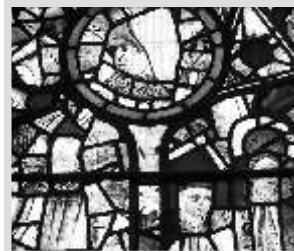
Medieval Glass @ Ecclesfield St Mary

Next time you visit a church, take time to admire the beautiful colours of the stained glass and discover the stories behind them! Our Heritage Festival in June is a great opportunity to discover and explore a wide variety of designs and styles.