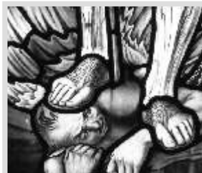
William Morris & Co @ Elsecar Holy Trinity